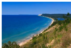
Michigan Summer Shores: Petosky & Charlevoix July 27-31, 2026 5 Days