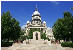
Mr. Lincoln's Hometown: Springfield August 3-5, 2026 3 Days