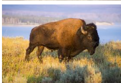
North Dakota & NEW Theodore Roosevelt Presidential Library September 10-16, 2026 7 Days