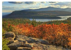
Adirondack Mountains, Lake Placid, FDR Library & NYC October 6-13, 2026 8 Days