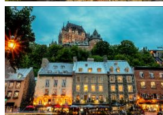
Montreal & Quebec October 10-15, 2026 6 Days