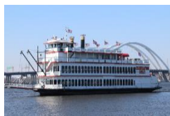
Mississippi River Cruise July 15-17, 2026 3 Days