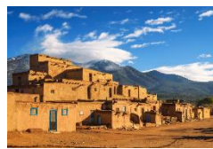
New Mexico: Santa Fe, Taos & Hot Air Balloon Festival October 4-12, 2026 9 Days