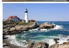
Rocky Coast of Maine, Bar Harbor & Acadia National Park October 14-21, 2026 8 Days